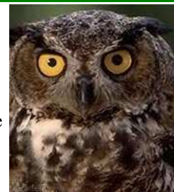
Exhibit: Get to know some amazing birds this Thanksgiving at the Monterey Bay Aquarium's "Feathered Friends" event. The weekend of activities highlights animals with beaks, wings and feathers—including the Aquarium's blackfooted penguins, Laysan albatross and shorebirds from our aviary. Fee: Included with Aquarium Admission Time: 10 a.m. - 6 p.m. Phone Number: (831) 648.4800