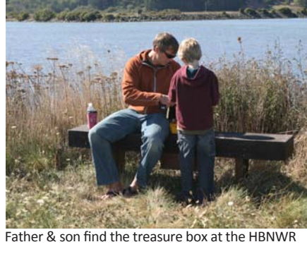
Father & son find the treasure box at the HBNWR

Call 707-733-5406 or visit www.fws.gov/humboldtby for more information.