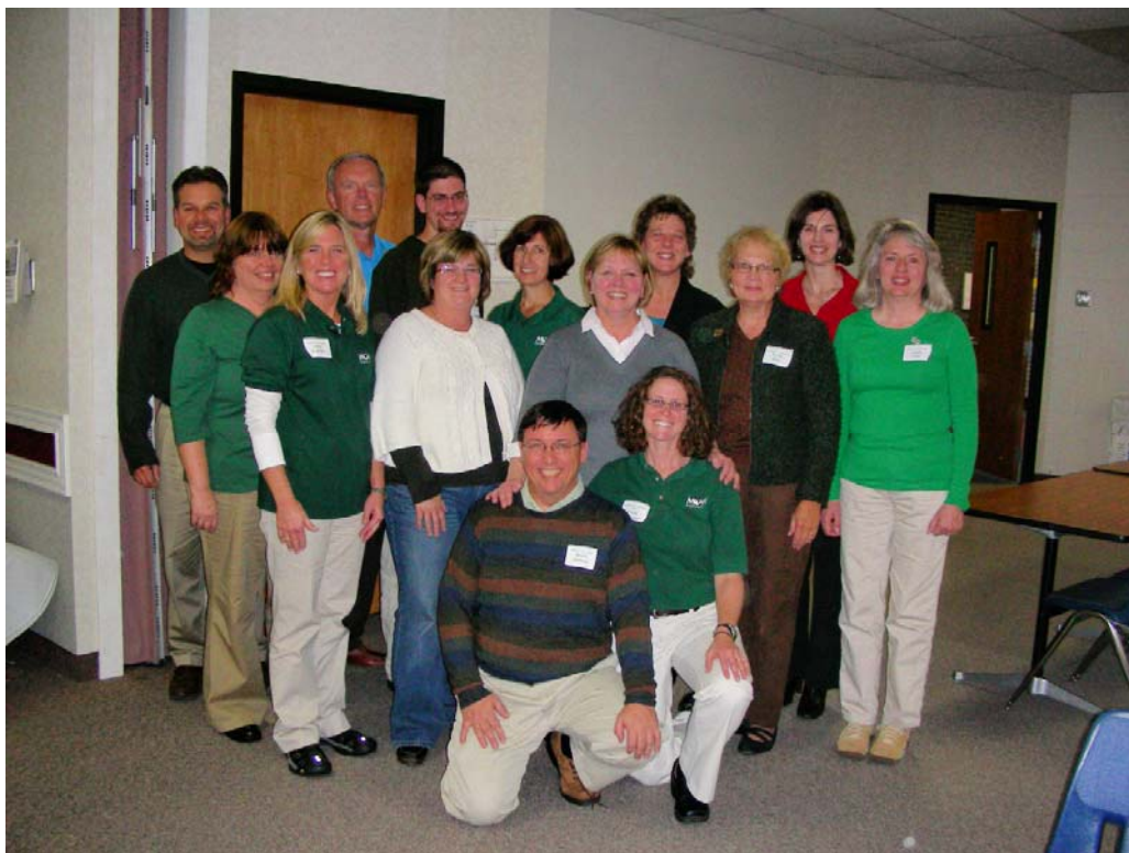
Michigan Move Clinic Planning Committee