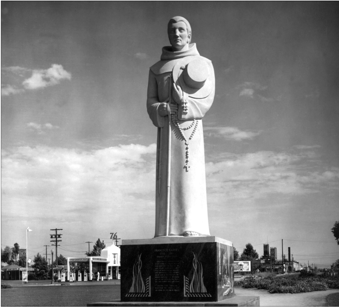
Statue of Father Garcés on Chester Avenue, Circa 1940