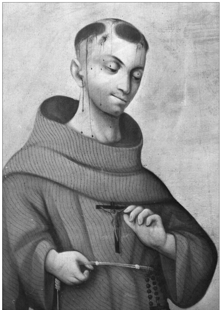
Father Francisco Garcés

program that was a unilaterally conceived plan for civilizing savage Indians who were regarded as not capable of participating in the formulation of any type of program that involved them. Father Garcés in turn believed that in order to civilize and save the indigenous peoples of the Americas it would be necessary to first elevate their social status and then undertake the process of a Christian education. The goal being that once the Indians were started on the road to Christianity and civilization they could be released from mission discipline. The mission could then be secularized, the Indians given their part of the mission property, and launched as full