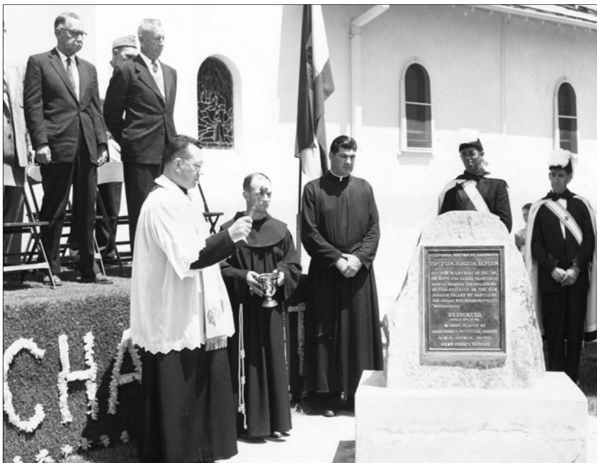
Dedication on April 29, 1956 of Historical Marker for Garcés Baptism of Muchachito