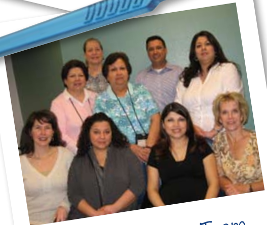
The Little Smiles Team