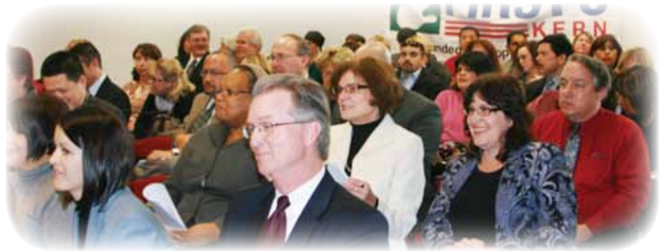
The Board room was packed when First 5 Kern Commissioners reviewed and approved $36 million for the 2010-13 funding cycle. Forty-three programs located throughout Kern County were selected for funding

The Commission received 76 proposals. The total funding requested vastly exceeded the amount of money