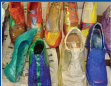
Shoe-In Awards, page 4