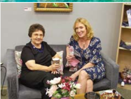
Artists can socialize at exhibit openings.

Your membership makes our mission possible—access, advocacy and education.