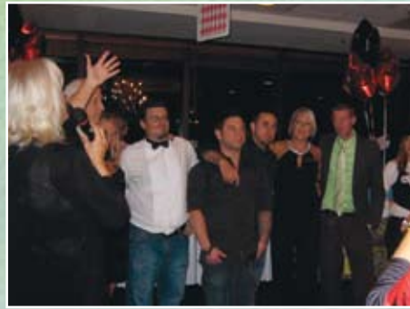
The ARTini 2009 fundraiser was held to benefit music and art programs in the schools. Here, bartenders wait to hear which bartender won out of the 11 that competed for best martini.