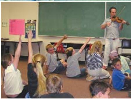
Arts in Education programs provide music experiences.