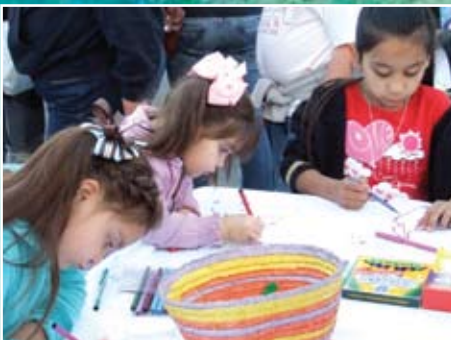
Art of Downtown Street Fair event bringing access to arts.