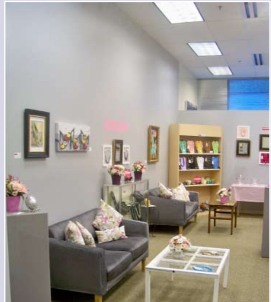
The Bedazzled Show is on exhibit until Dec. 23, 2009 at the Larry E. Reider Gallery.

Gallery until December 23, 2009. Local artists have created one-of-a-kind baubles for you. Prices range from $15 - $875, so there's something for everyone in every price range. New jewelry is arriving from the artists weekly so the exhibit is always changing. Bedazzle your loved ones or yourself with amazing jewelry from local artists!