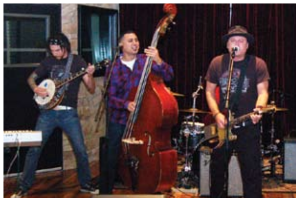
The Iron Outlaws audition for a chance to participate in the Irvine Grant, which advocates for local musicians to perform around the county.

Currently, those performers selected by the panel are being prepared to perform in local venues, and be professionally recorded and filmed for a documentary. Next year, you will all have the delight of hearing these amazing musicians. Stay tuned and watch for the announcements of upcoming concerts!