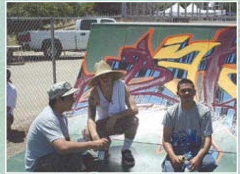
Access for graffiti artists to use their skills in positive ways. Arvin Green Arts Festival.